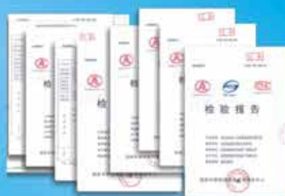
通過國家級檢驗 "Get across national examination"