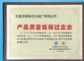
榮獲“產品質量信得過企業” "Enterprise of high quality products".