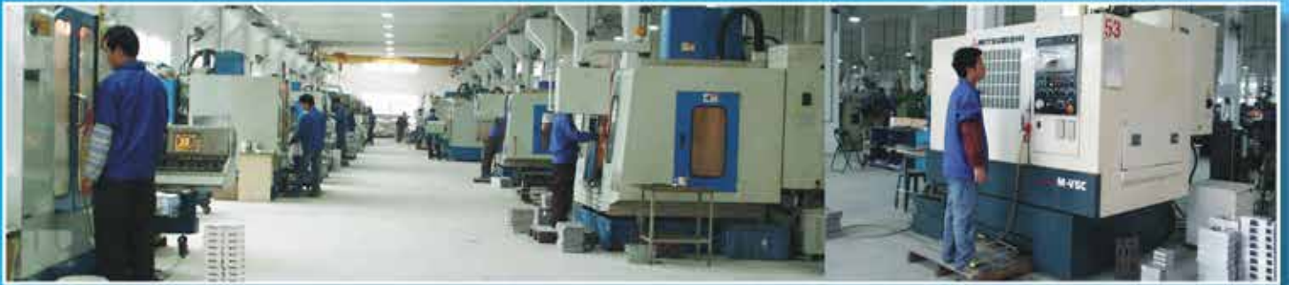
CNC 車間 / CNC Workshop