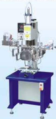
HT-300S 氣動膠輥式曲面熱轉印機 Auto Cylindrical Heat Transfer Machine with Rubber Roller