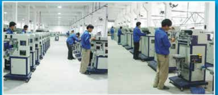
組裝車間 / Assembly Workshop