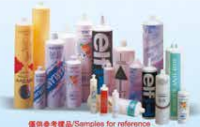
僅供參考樣品/Samples for reference

廣泛適用於化妝品、醫藥等表面印刷 MAINLY USED IN COSMETIC & MEDICINE. SURFACE PRINTING