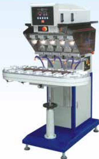
SP-858D 氣動五色輸送帶移印機 Pneumatic 5-Color Pad Printer With Conveyor