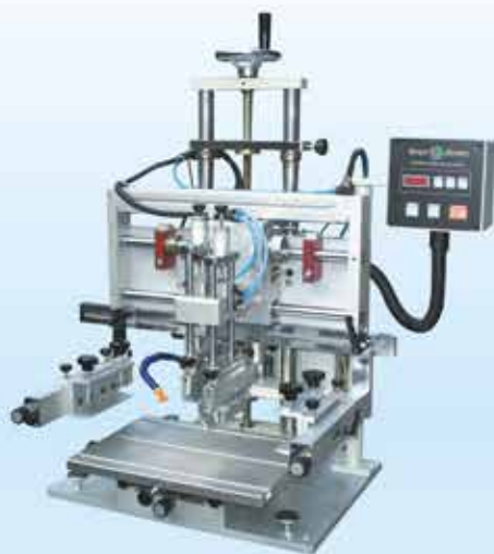
S-200HFC 氣動平面絲印機 Pneumatic Flat Screen Printer