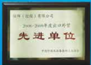
連續四年榮獲 “中國印刷及設備器材出口外貿先進單位” got "Advanced company" from Chinese Printing and Equipment Import&Export Community.