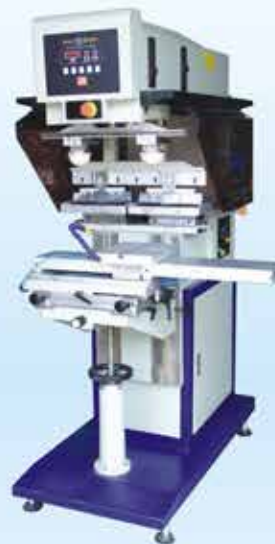
SP-8410SD 氣動四色穿梭移印機 Pneumatic 4-Color Pad Printer with Shuttle