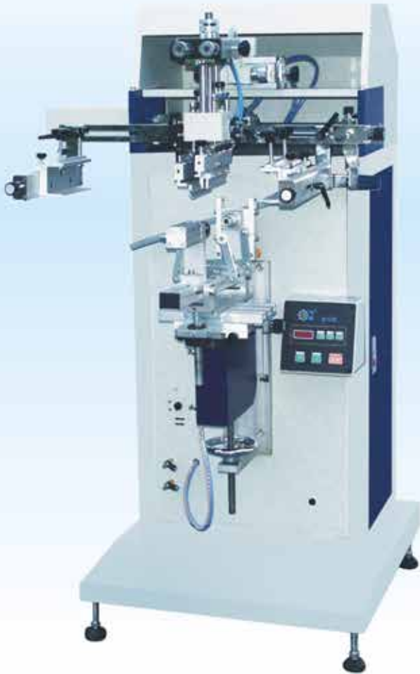
S-300S 氣動圓面/錐面絲印機 Pneumatic Cylindrical /Conical Screen Printer