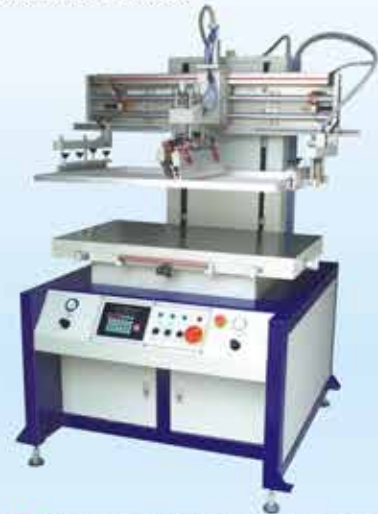
S-1000F 氣動真空吸氣大平面絲印機 Pneumatic Large Flat Screen Printer with Vacuum Suction Table