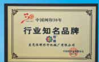
榮獲“行業知名品牌” "The well-known brand in industry".