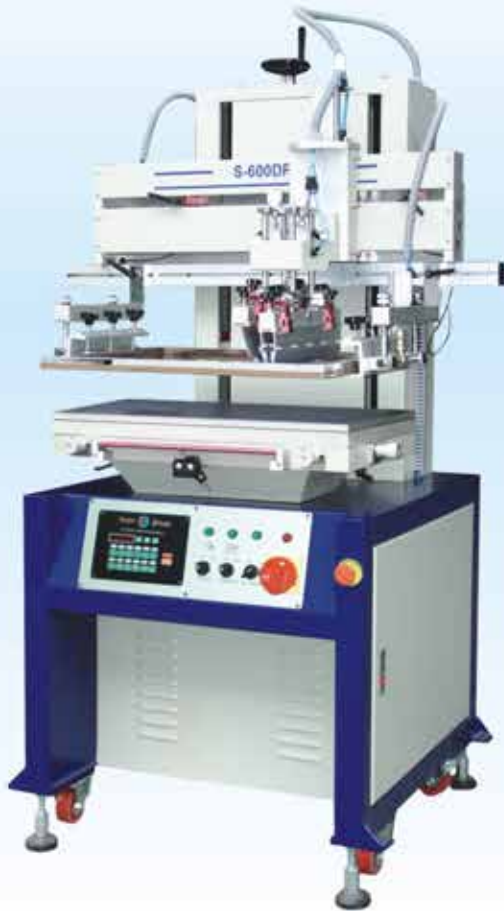
S-600DF 氣動真空吸氣平面絲印機 Pneumatic Flat Screen Printer with Vacuum Suction table