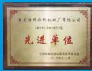
榮獲“全國印刷機械標準化先進單位” "Chinese printing machinery standard advanced company".