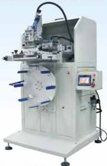
S-125RV 氣動平面絲印機 Pneumatic Flat Screen Printer