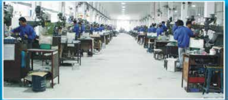
生產車間 / Workshop