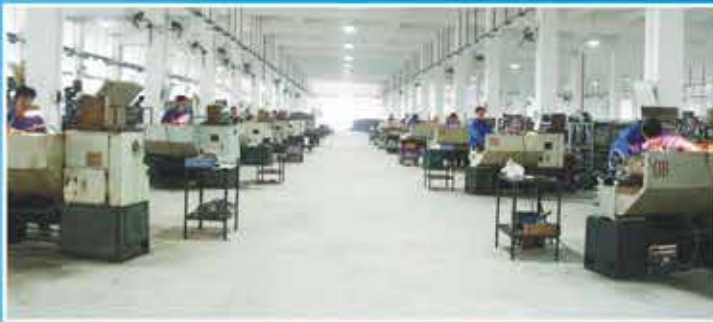
生產車間 / Workshop