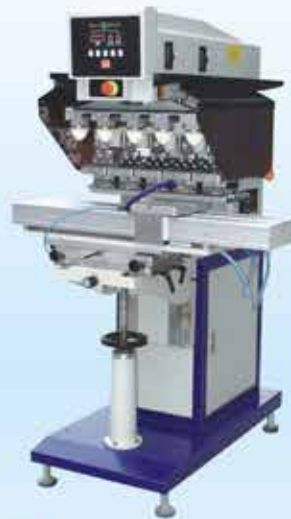
SPC-846D 氣動四色輸送帶油墨移印機 Pneumatic 4-Color Pad Printer with Conveyor & Sealed Ink Cup