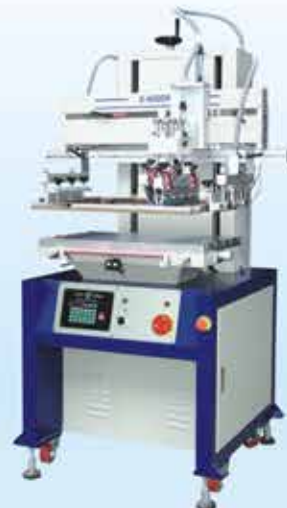
S-600DFE 氣動平面絲印機 Pneumatic Flat Screen Printer