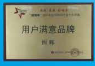
榮獲“用戶最滿意品牌” "The most satisfied brand".