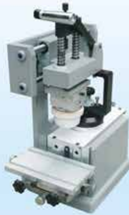
SPC-100 手動單色油墨移印機 Manual 1-Color Pad Printer with Sealed Ink Cup