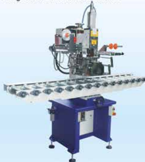
H-05/20 氣動錐形燙金機 Hot Stamping Machine For Conical Substrate