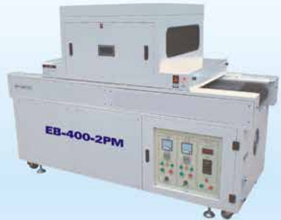
EB-400-2PM 平面UV 光固機 Flat UV Curing Machine

本產品主要用于各種紙張、禮品包裝盒、挂曆、紫外線防偽印刷、PVC膠片粘紙、電路板、塑料制品等表面UV油墨及UV光油的固化 EB-800PM flat UV curing machine is mainly used for the curing of UV ink and varnish on various surface of paper, gift packing box, hanging calendar, ultraviolet fakement-proof printing, PVC membrane paper, circuit board, plastic products and so on.