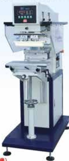
SP-818C 氣動單色移印機 Pneumatic 1-Color Pad Printer