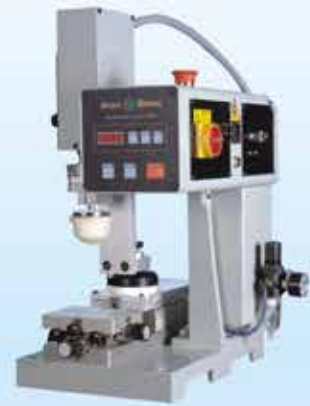
SPC-84 氣動單色油墨移印機 Pneumatic 1-Color Pad Printer with Sealed Ink Cup