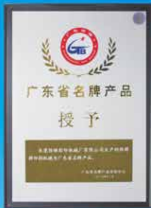
廣東省名牌產品 Guangdong Top Brand