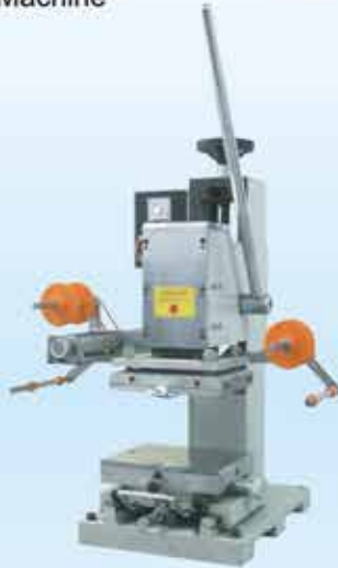
H-190 手動平面燙金機 Manual Flat Hot Stamping Machine