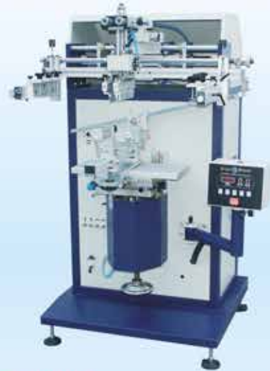
S-400MB 氣動平面/曲面絲印機 Pneumatic Flat/Cylindrical Screen Printer