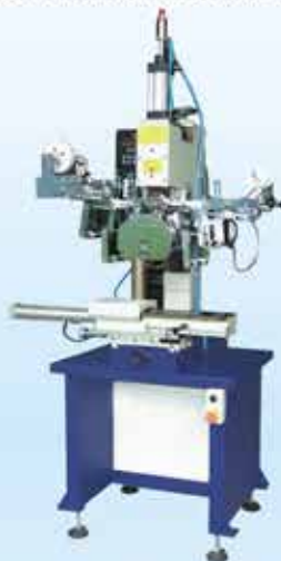
HT-300F 氣動膠輥式平面熱轉印機 Auto Flat Heat Transfer Machine with Rubber Roller