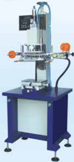
H-198 氣動平面燙金機 Pneumatic Flat Hot Stamping Machine