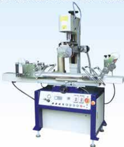
HT-500F 氣動膠輥式平面熱轉印機 Auto Heat Transfer Machine with Rubber Roller