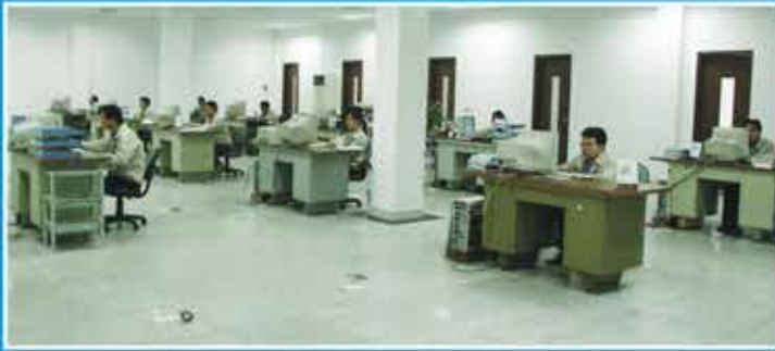
研發中心 / R&D Department