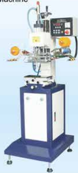
H-168 氣動平面燙金機 Pneumatic Flat Hot Stamping Machine