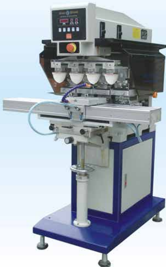
SP-846SD 氣動四色穿梭移印機 Pneumatic 4-Color Pad Printer with Shuttle