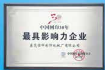
榮獲“最具影響力企業” "The most influential enterprise".