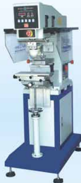
SP-818D 氣動單色移印機 Pneumatic 1-Color Pad Printer