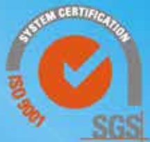
Certificate HK98/13859 通過 ISO9001:2008 國際質量體系認證