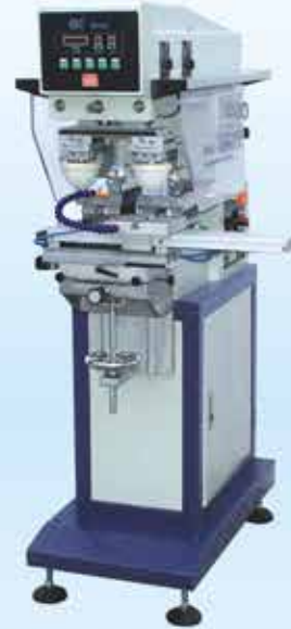
SP-846SC 氣動四色穿梭移印機 Pneumatic 4-Color Pad Printer with Shuttle