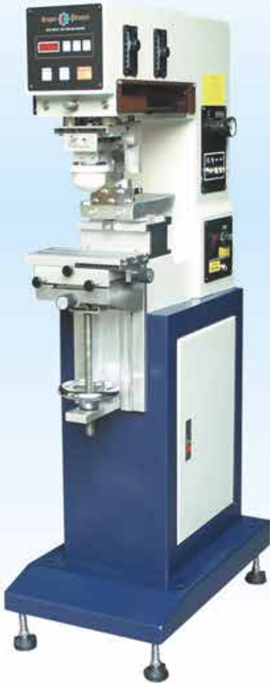
SP-814E 氣動單色移印機 Pneumatic 1-Color Pad Printer