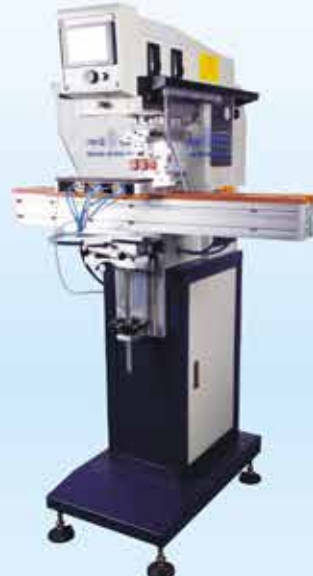
SP-824SC 氣動雙色穿梭移印機 Pneumatic 2-Color Pad Printer with Shuttle