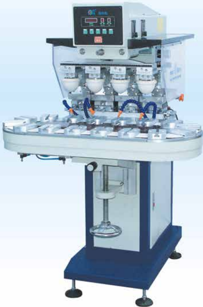
SP-846C 氣動四色輸送帶移印機 Pneumatic 4-Color Pad Printer with Conveyor