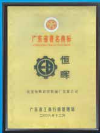
廣東省著名商標 Guangdong Famous Trademark