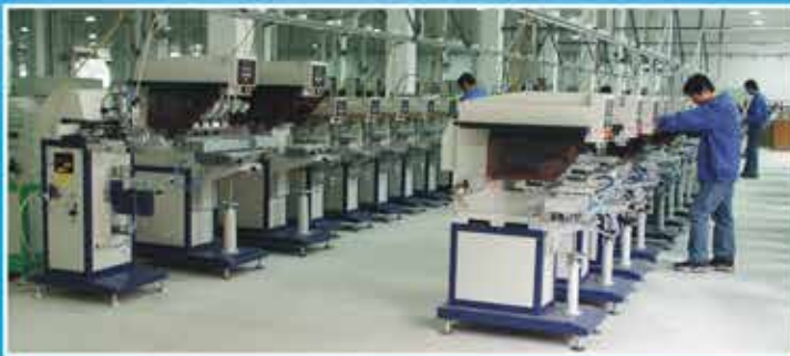
QC 車間 / QC Workshop