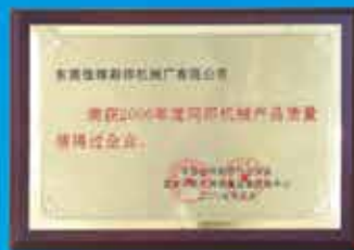
榮獲“年度網印機械產品質量信得過企業” "Enterprise of high quality frame printing machinery products".