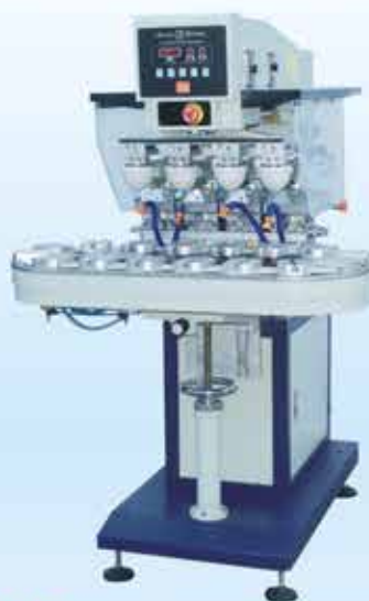
SP-846D 氣動四色輸送帶移印機 Pneumatic 4-Color Pad Printer with Conveyor