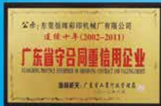
連續十年榮獲守合同重信用企業 "Enterprise of observing contract and valuing credit".