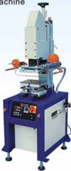
H-200B 氣動平面燙金機 Pneumatic Flat Hot Stamping Machine