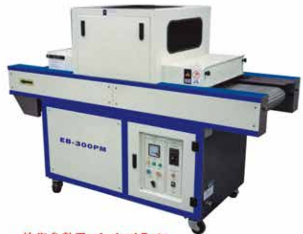
EB-300PM 平面UV 光固機 Flat UV Curing Machine

本產品主要用于各種紙張、禮品包裝盒、挂曆、紫外線防偽印刷、PVC膠片粘紙、電路板、塑料制品等表面UV油墨及UV光油的固化。還可用于卡紙表面印刷UV磨砂、冰花、MK皺紋、仿金屬蝕刻油墨等表面圖案的生成。 EB-800-3PM flat UV curing machine is mainly used for the curing of UV ink and varnish on various surface of paper, gift packing box, hanging calendar, ultraviolet fakement-proof printing, PVC membrane paper, circuit board, plastic products and so on. It can also be used to form the surface figure of cardboard surface printing UV grinding sand, ice flower, MK wrinkle, metal-imitating etch ink and so on.