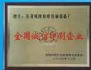
榮獲“全國誠信印刷企業” "Chinese high credit printing enterprise".