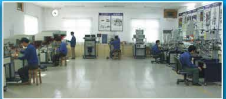
打樣部 / Proof Ministry