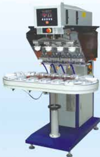
SP-8410D 氣動四色輸送帶移印機 Pneumatic 4-Color Pad Printer with Conveyor