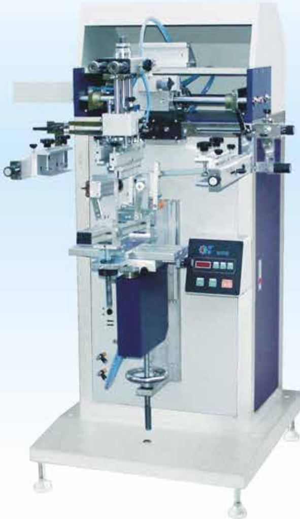
S-300M 氣動平面/曲面絲印機 Auto Flat/Cylindrical Screen Printer