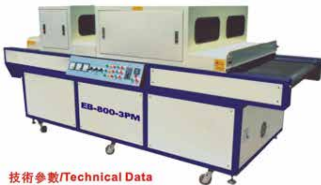
EB-800-3PM 平面UV 光固機 Flat UV Curing Machine

本產品主要用于UV油墨印刷后的小型物件表面光固和小批量物件的表面烘干。 The machine is mainly used for the surface curing of minitype objects and surface drying of small batch of objects after finished UV ink printing.