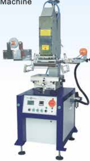
H-250 氣動平面燙金機 Pneumatic Flat Hot Stamping Machine