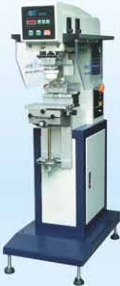
SP-818C 氣動單色移印機 Pneumatic 1-Color Pad Printer