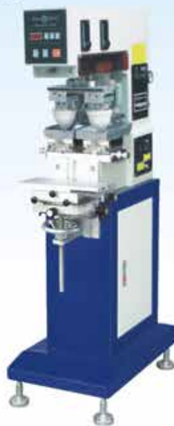
SP-814TE 氣動單色雙印頭移印機 Pneumatic 1-Color Pad Printer with 2 Pads