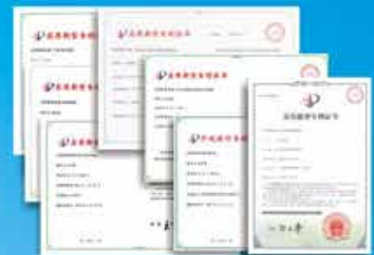
擁有數十項實用新型及外觀設計專利 "Own some practical new type and appearance design patent"