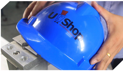
仅供参考样品 Sample for reference