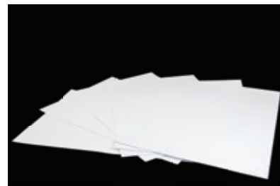
Sublimation ink Printing Paper