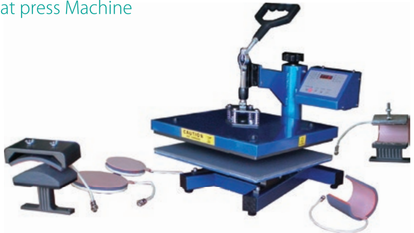
Plate Heat Press Series